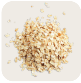
Extruded Products & Breakfast Cereals