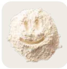
Flours & Bakery Mixes